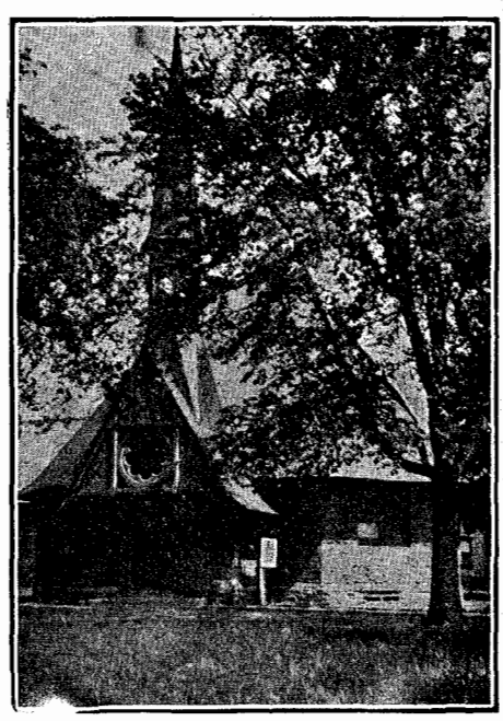
The Pentecostal Church, Scranton, Pa.

Scranton is the Mother-Church of the Anthracite section, and a drawn circle with a diameter of 60 miles, having Scranton as its center, would include a group of 20 or more Pentecostal churches and missions that were born out of God's work in Scranton. Besides this branching out in near-by fields, 17 or more of its members have gone out into the Lord's service, either as missionaries in foreign lands or Christian workers in the homeland. The